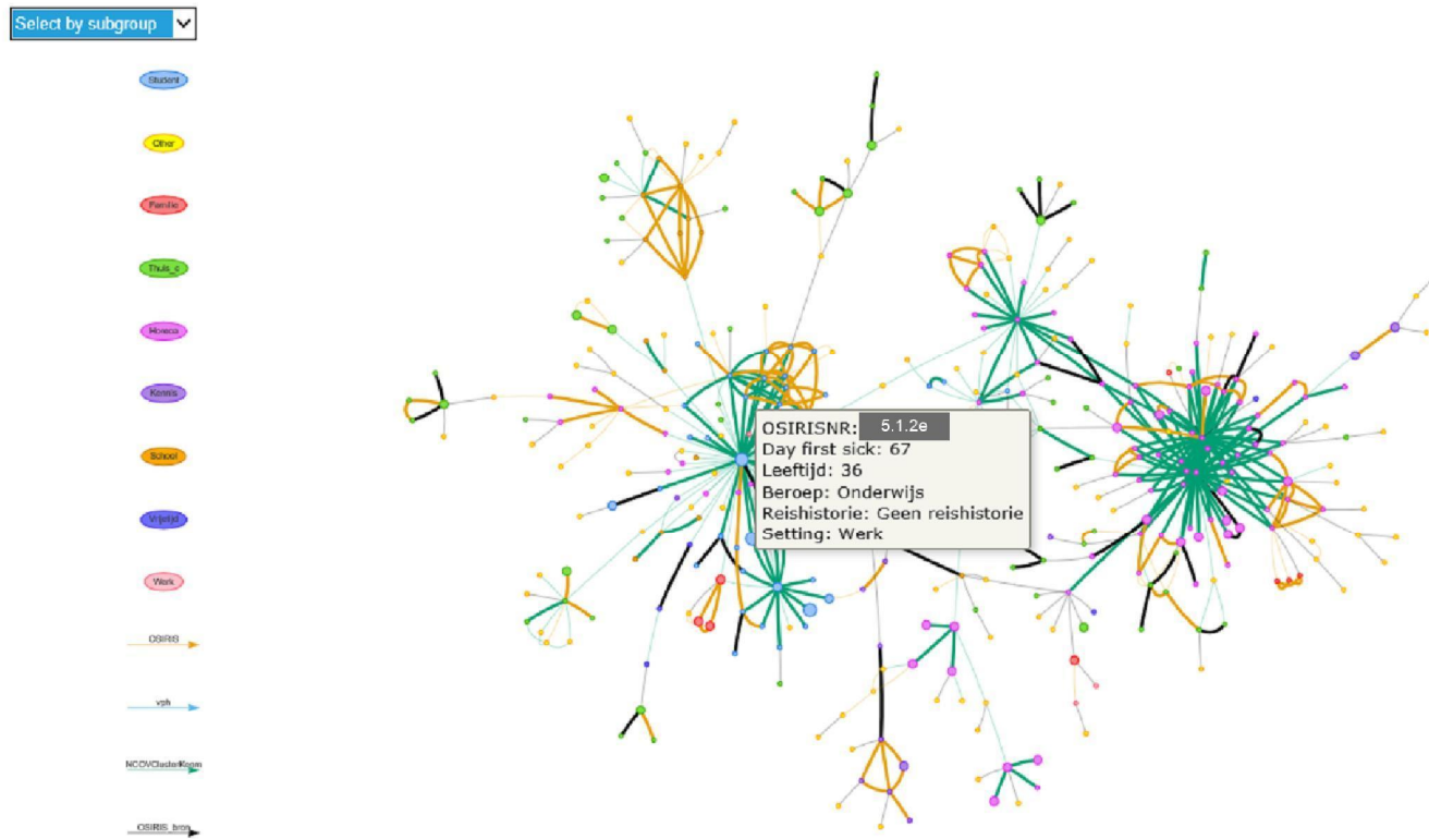
Figure 2: Print screen of a transmission chain containing many different clusters. Edges within clusters are represented using a thick line, edges within a transmission chain are represented using a thin line. The source of evidence used for the edge is indicated by the colour of the edge. Edges spanning longer than 10 days are indicated using the number of days in red font. (Not visible in this screen shot.) The colour of the nodes indicate to which cluster setting individuals belong. The size of the nodes indicates whether a person was one of the first (first two days: 0,1,2) in the cluster or transmission chain to become symptomatic. Hovering over a node provides additional information on the node. Clicking on the node allows one to see the edges of which the node is a member. Selection by cluster occurs in the top left of the screen. Selection can also be done by node setting, but we can only have one drop down menu. Demo to come on Thursday.